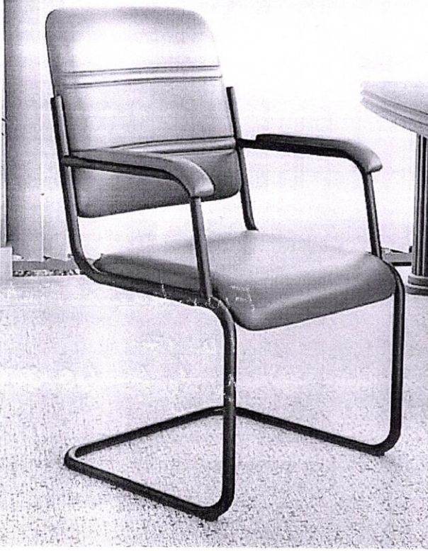
Item 1: Visitor Chair